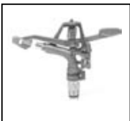
P85A P = Part Circle A = Low Angle V (not shown) = Vane