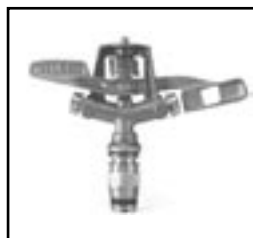
F33AA F = Full Circle AA = Low Angle, Double Nozzle