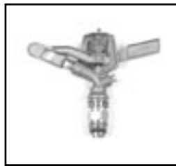
F33P F = Full Circle P = Plug in Second Nozzle