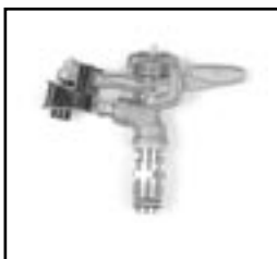
L20W - 7° L = Low Angle W = Wedge Drive