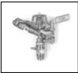
P35 P = Part Circle