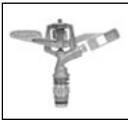
F33S F = Full Circle S = Single Nozzle