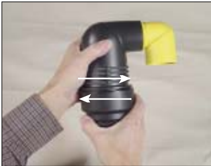
1. To begin, unscrew ACV200 body.