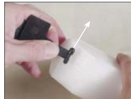
6. Remove old seal from float.