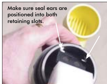
8. Carefully guide seal into slots.