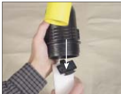
5. Pull float and seal from body.