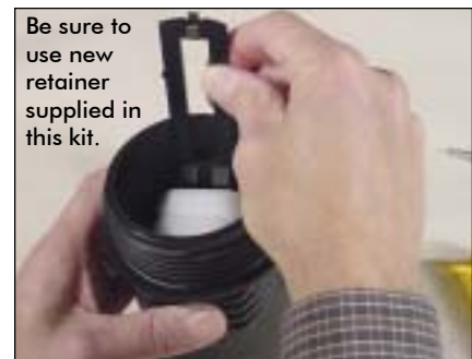
9. Slide in new retainer.