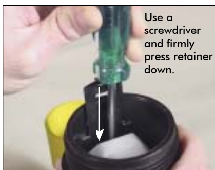
10. Press in retainer to hold seal.