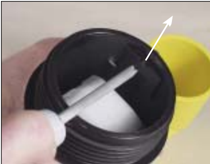
4. Use screwdriver to pry seal retainer out.