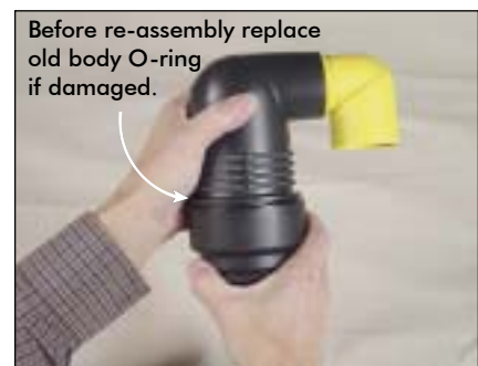
12. Screw body back together.