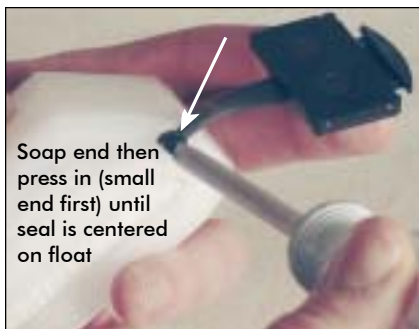
7. Press in new seal onto float.