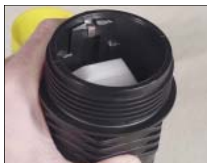
11. Retainer fully pressed in place.