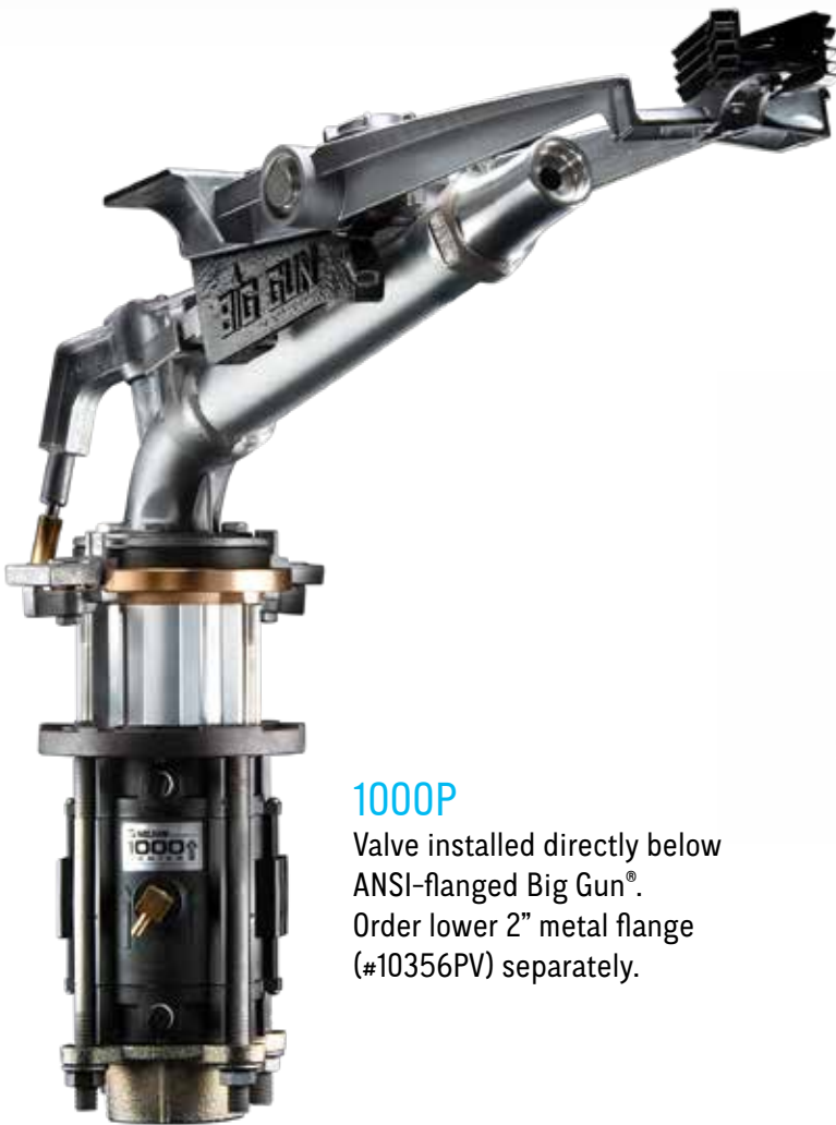
1000P Valve installed directly below ANSI-flanged Big Gun®. Order lower 2” metal flange (#10356PV) separately.