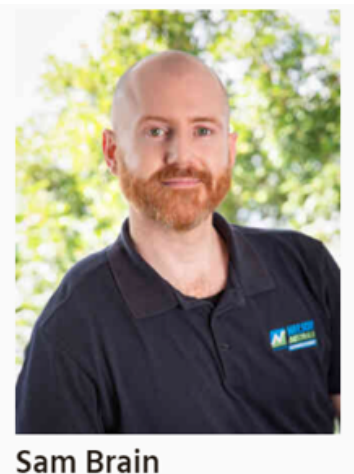
Customer Service Brisbane