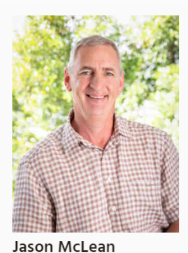
Technical Customer Service Brisbane