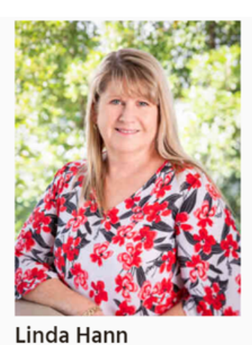
Customer Service Brisbane